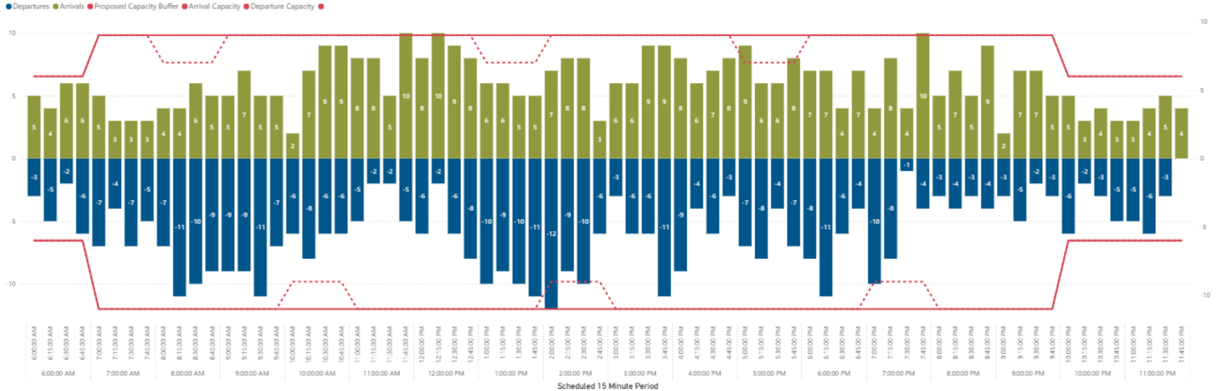
July 30th 2026 Actual Demand vs Capacity